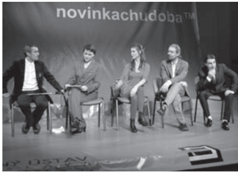
powertynew<sup>™</sup>. Studio 12. Bratislava. 2007. Directed by: M. Langer-Philippsen

Modern societies with strong bureaucratic systems and division of labour create a number of independent and disconnected worlds where they build their own rules of quality, meaning and usefulness. And when the activity of experts is approved by social morals that value work, dedication and increasing effectiveness, then the zeal and enthusiasm of such experts are even higher. This is all very well until the experts leave their professional communities. In a confrontation with other specialists it is impossible to have a rational discussion, let