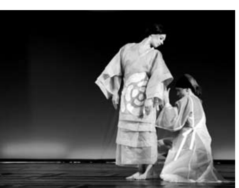
Under Cherries in Full Bloom. State Opera, Banská Bystrica, 2008. Directed by: M. Hriešik

Ballet, as a medium, is for me much more attractive - there is no